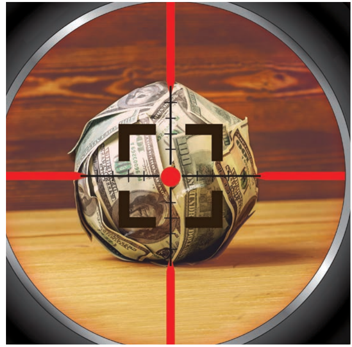
THE ANNUAL BANKRUPTCY ISSUE